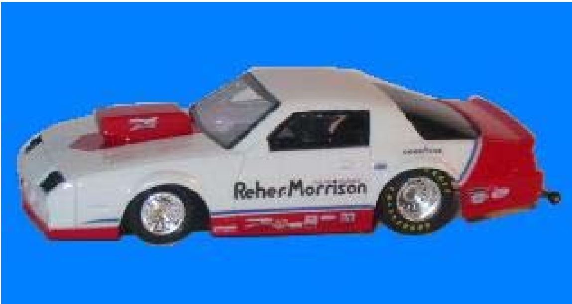
Camaro By SKRCUSTOMS